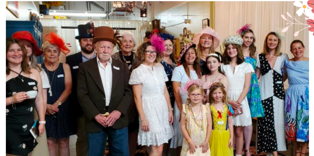
Tea Party at Tea with Mrs. B.