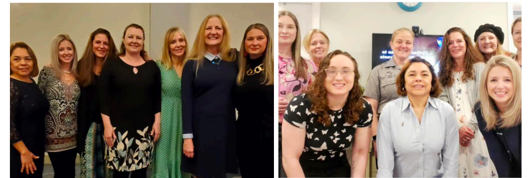
NIFLA Conference & Training